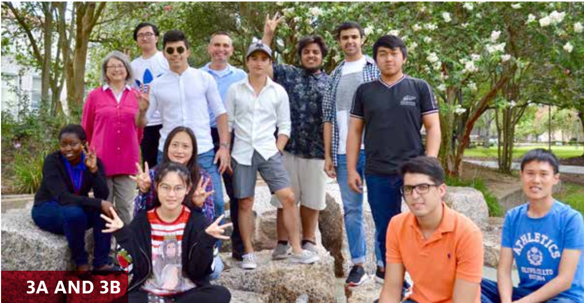
3A AND 3B