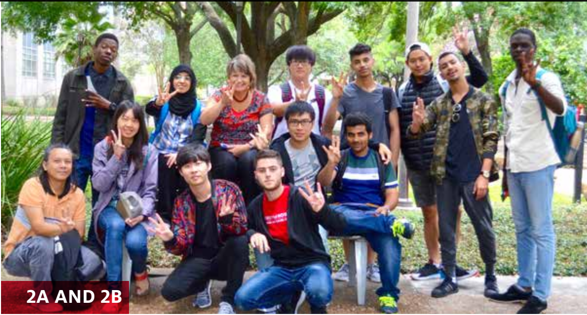
2A AND 2B