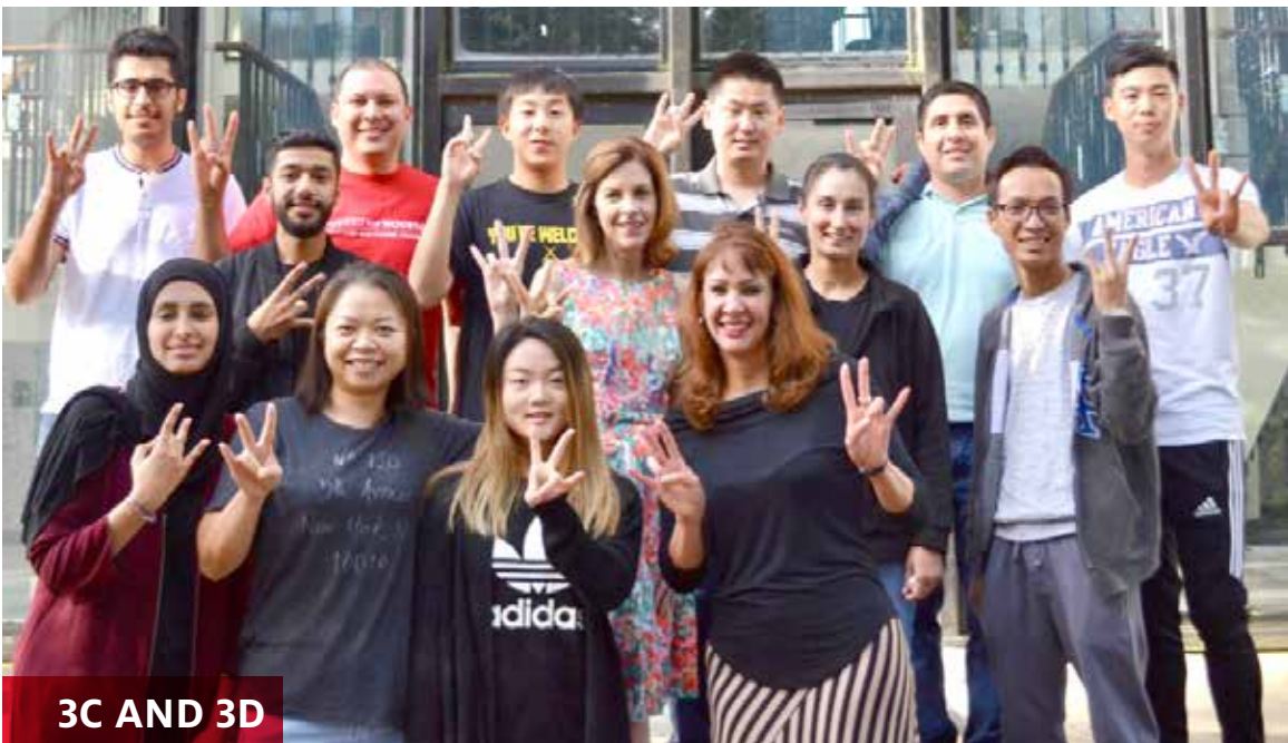
3C AND 3D