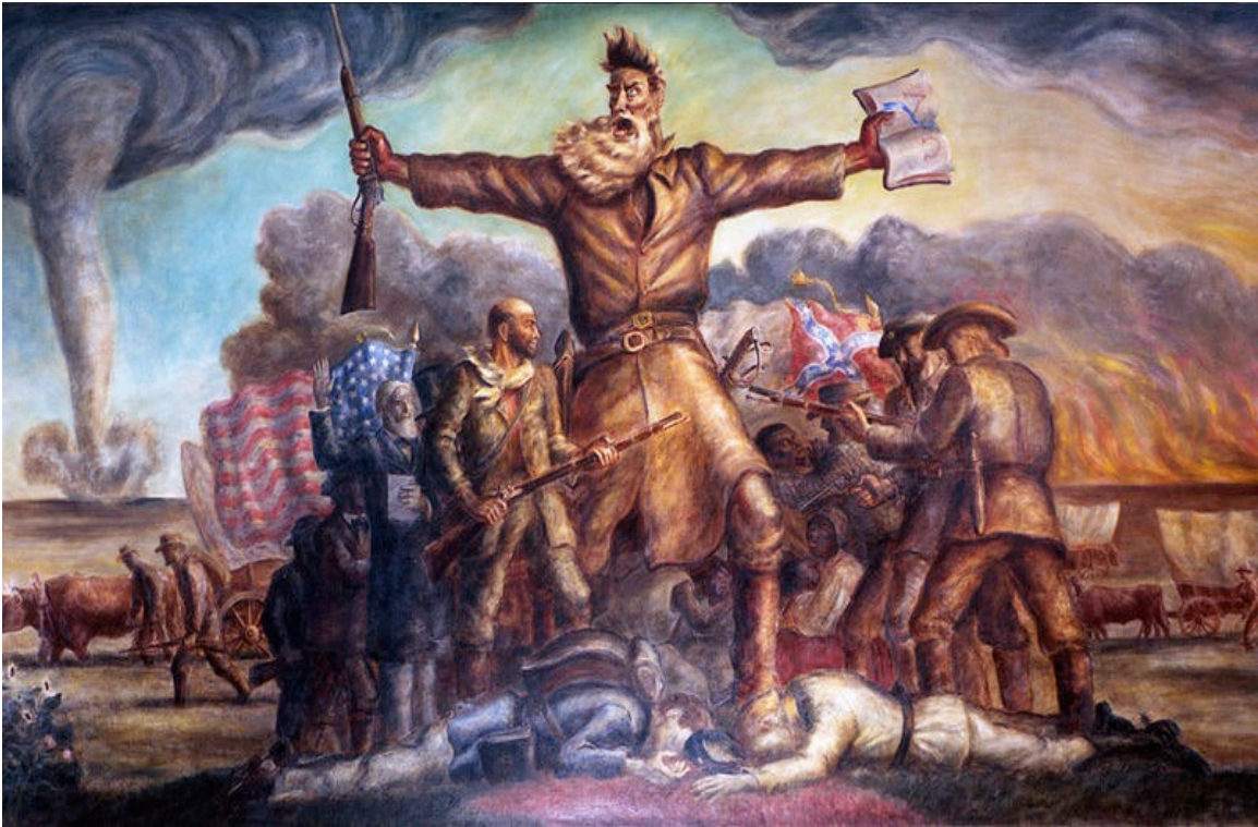
John Stuart Curry, Tragic Prelude (1938-1940). Mural in Kansas State Capitol Building