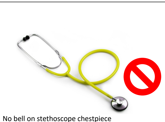
No bell on stethoscope chestpiece