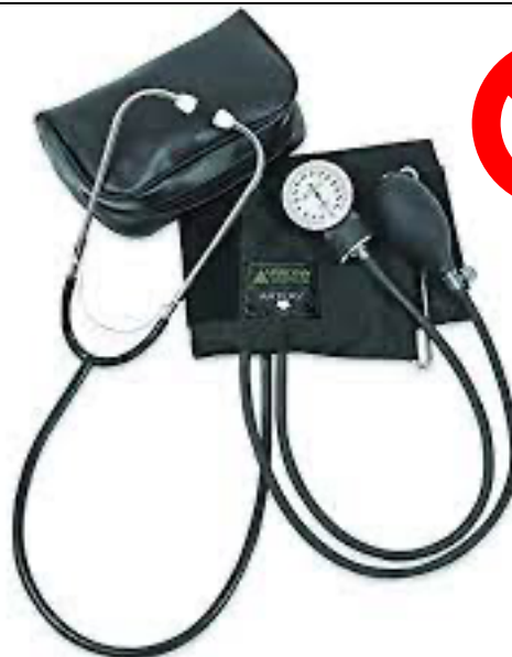
Stethoscope connected to cuff