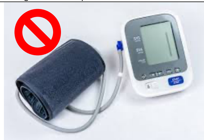
No automatic BP cuffs