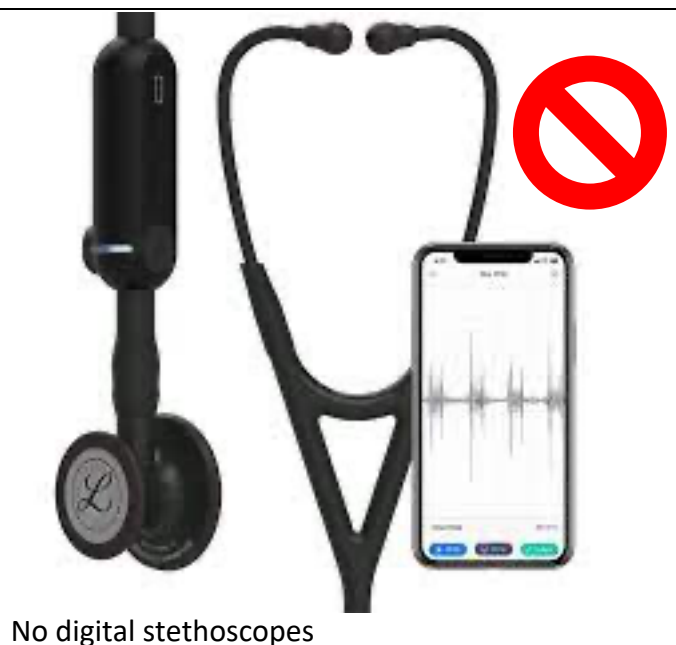
No digital stethoscopes